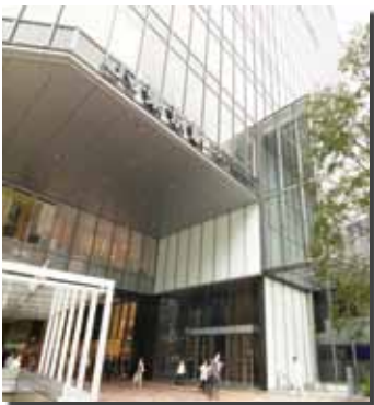
Project: GRAN TOKYO, Tokyo, Japan Architect: Murphy/Jahn, Inc. Glass Laminator: Shanghai Safety

In both interior and exterior applications, Vanceva white interlayers complete the most dramatic designs allowing for total opacity for private settings or translucent designs to let the light shine in—plus greater flexibility between these extremes. Vanceva interlayers provide superior uniformed color, which results in a unique, even reversible, white safety glass. It's one reason why architects and designers trust Saflex to deliver the 'right white in every light'.