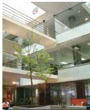
Project: Ernst and Young Architects: Inhouse Brand Architects Glass Manufacturer: Renè Turck & Associates