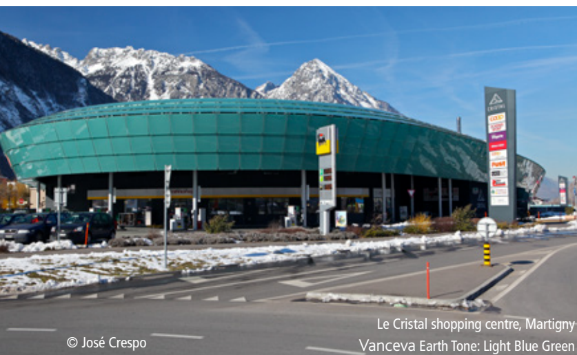
Le Cristal shopping centre, Martigny Vanceva Earth Tone: Light Blue Green